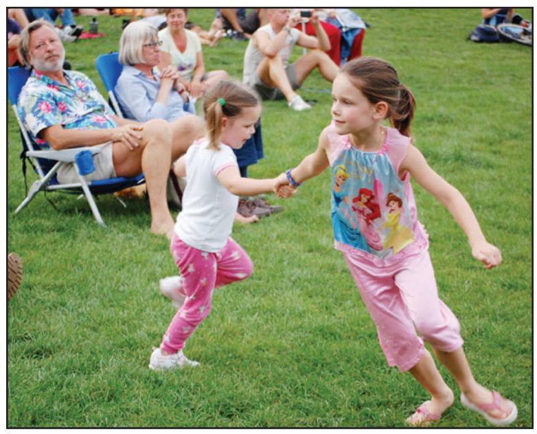
Boston Urban Music Festival City Hall Plaza, Boston August 6 Saturday 4 p.m.

Featuring a blend of the emerging and established performing artists from the Boston arts community. This free series, presented by Mayor's Office of Arts, Tourism, & Special Events has included Boston Ballet, Boston Lyric Opera, Riverside Theatre Works and the Boston Pops Ensemble. For more information, call (617) 635-3911 or visit www.cityofboston.gov/arts.