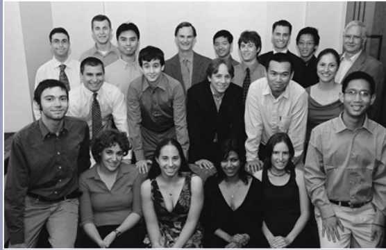
2008 Sigma Pi Sigma inductees.