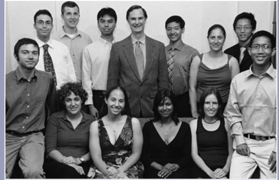
2008 Phi Beta Kappa inductees.