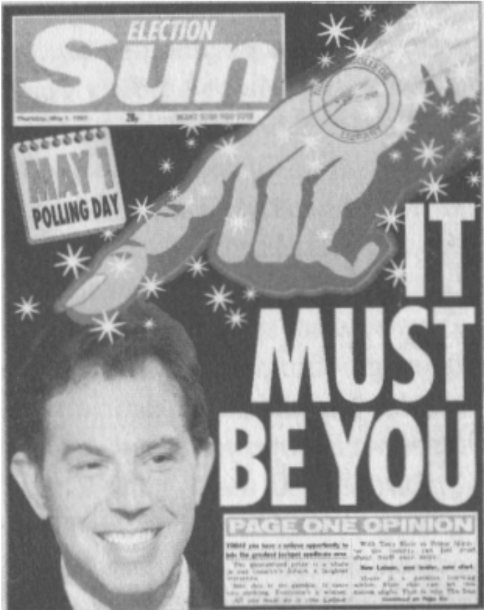
Figure 1S: Front Page of the Sun on Election Day, May 1, 1997