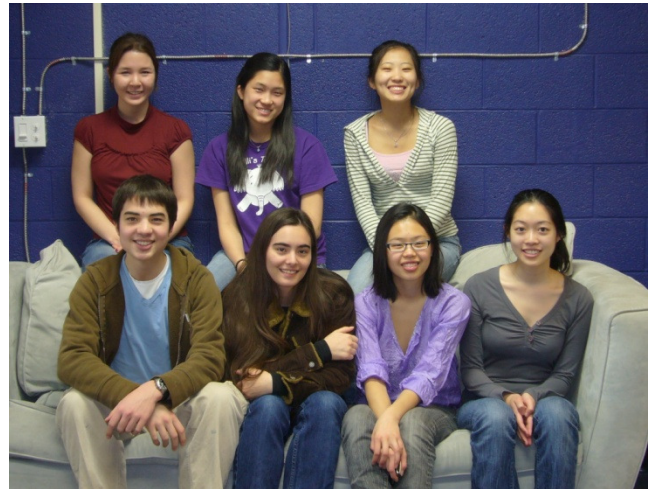
Rune editorial staff

Rune publishes once per year in May, and we print approximately 1200 copies which are distributed at no cost to the greater MIT community.