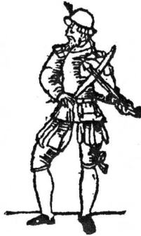
Figure 1: Violinist from Arbeau.

Dolor sit amet, consectetur adipiscing elit, sed do eiusmod tempor incididunt ut labore et dolore magna aliqua. Ut enim ad minim veniam, quis nostrud exercitation ullamco laboris nisi ut aliquip ex ea commodo consequat. Duis aute irure dolor in reprehenderit in voluptate velit esse cillum dolore eu fugiat nulla pariatur. Excepteur sint occaecat cupidatat non proident, sunt in culpa qui officia deserunt mollit anim id est laborum.