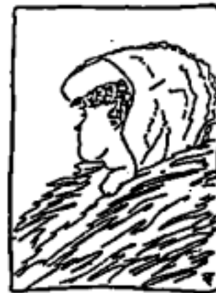
Figure 3. Old woman or young?

This standardization assumption can be a critical problem. For example, consider Figure 3; is it a picture of an old lady or a young lady? The point here is that some will see it one way, some will see it the other way, and most be able to see both images – but only one at a time. [If you are unable to see both, email me and I will send clues for seeing each.] This is the situation that we