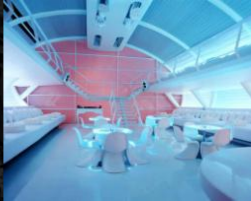
Bed & Supper Club