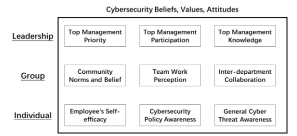
Figure 2. Three organizational levels of cybersecurity culture

The leadership in an organization plays a significant role in creating and propagating the organization's culture. Top management are both the mechanism to stop external forces from impacting the organization, and the decision maker for investing limited resources. In addition, leaders set an example for others which influences cognitive beliefs. When employees see leaders prioritizing and participating in cyber-security activities, it influences employees own involvement.