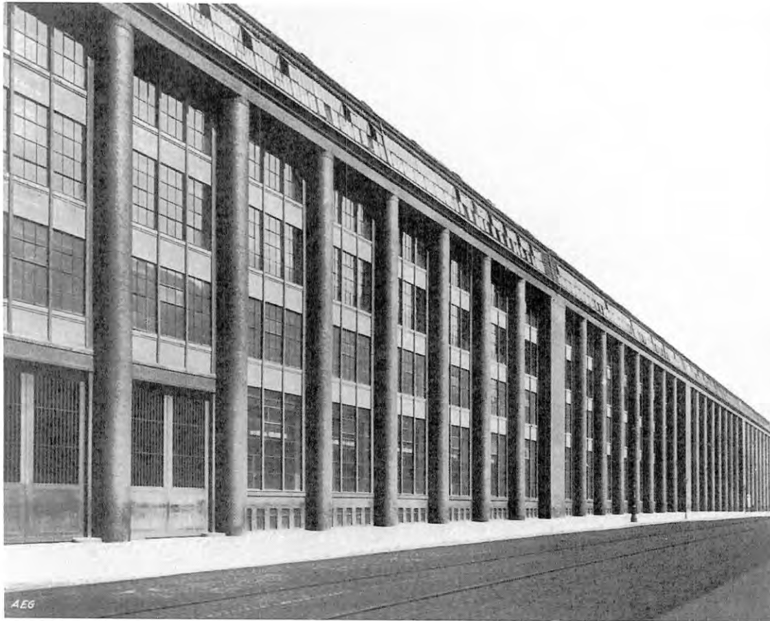
6.5 Peter Behrens AEG Turbine Factory 1908–1909, street view