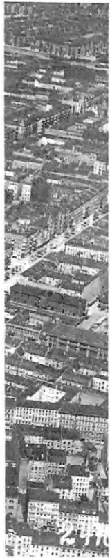
1. Berlin on the 1, 1909 aerial