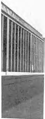
AEG Small Motors 1913, street view

If the modern Zeitgeist invokes continuous building forms of repetitive units deployed on straight streets, the foil must be – how could it be otherwise – Sitte's medievalizing idyll of curving streets and closed squares formed by individualized building units. But such a dichotomy is definitely too simple if not