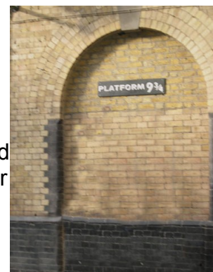
Illustration 2: Fourth source image with subjects removed.

To give the second image a more interesting context, I searched through my collection of photographs, and decided that Platform 9 \frac{3}{4} at King's Cross (made famous by the story Harry Potter) would make a good backdrop. In order to remove the 2 subjects from the photo, I used the clone tool to use textures found elsewhere in the photo to patch over the regions I wanted to cover. This resulted in the image on the right.