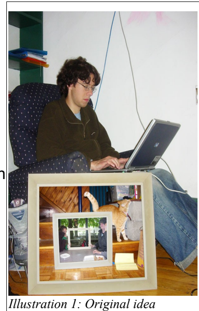
Illustration 1: Original idea