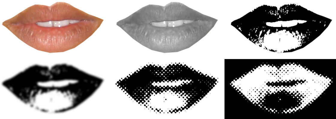
Steps to create Lips and Sunburst print.

I used Adobe Photoshop to make digital negatives for my cyanotype prints. I used the same techniques to create my lip negative as well as my sunburst negative. First, I used the pen tool to cut out the portion of interest in the picture then desaturated the image to make it black and white. Then I changed the threshold until I reached the black to white ratio I liked. I used the Gaussian Blur filter to blur 3 pixels to make the images smooth so I could put a halftone screen to make the dots. Once I had that I inverted the black and white for the lips to get the checker pattern of four seen below. I added a custom shape available in Photoshop to make the sunburst on the image below the lips. I inverted what is currently seen here to make the digital negatives for my cyanotypes since I wanted them to be similar to the images I made in Photoshop.