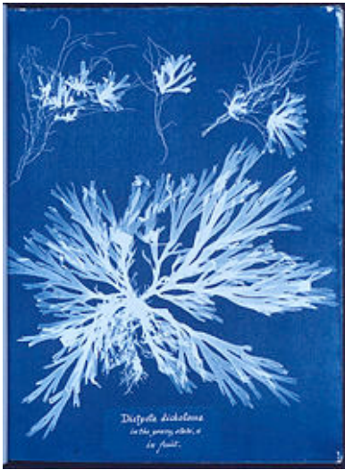
Anna Atkins, 1843 British Algae: Cyanotype Impressions

There were two motivations for my final project—cyanotype prints and the pop art movement. One of my favorite labs for this class was when we learned to make cyanotypes. I knew that I wanted my final project to involve cyanotyping but I wanted to put a twist on an old technique. I wanted to take something new, like pop art, and print and cyanotype it. I took examples of popular pop art prints to model my self-portrait series after Roy Lichtensein and Andy Warhol. The following figures are examples of works that I used for inspiration.