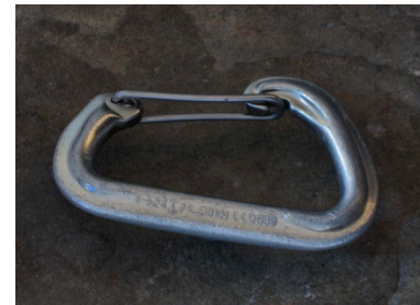
Wire gate karabiner