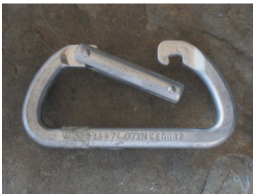
Straight gate karabiner

That karabiners fail with their gate open is not surprising given that the tensile strength of a karabiner with an open gate is typically 7 kN as opposed to 25 kN for a karabiner with the gate closed. What is less obvious is how the gate was open when the karabiner failed. The two possible scenarios involve the gate being open before the fall which caused failure of the karabiner, or whether the act of falling itself in some way led to the opening of the gate and the subsequent failure of the karabiner. The aim of this analytical study is to investigate whether the karabiner gate could be excited and induced to open by oscillation of the rope.