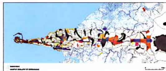
Conakry's rapid expansion has led to the blossoming of peri-urban settlements, and even of planned subdivisions, not served by the water network.

Growth of this activity would depend on SEEG's decision to grant a concession for additional network extensions and to offer reduced water rates to standpipe concessionaires.