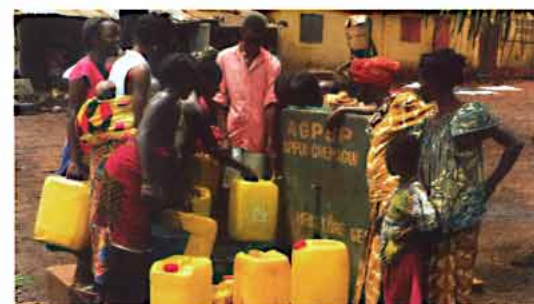
Technical assistance is provided at low cost by the Guinea office of the Regional Water and Sanitation Center (CREPA)