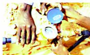
Network extension works and installing house connections