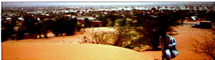
Secondary centers (with 2,000 to 15,000 residents) represent more than a third of Mauritania's urban population.