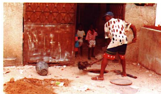
For less than CFAF 9,000, a latrine cleaner can buy the equipment he needs to go into business for himself: bucket, rope, pick and shovel