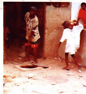
Cost of maintaining an 8-m3 household latrine pit CFAF 15,000 a year