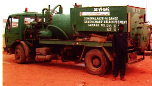
For pit cleaning, the work of the pick and shovel men complements that of the suction trucks, which are equipped with a simple pump