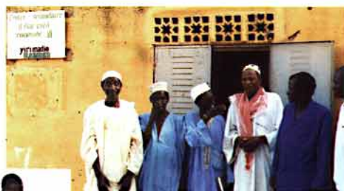
The private operator chosen by Yirimadio's Water Users' Association is a native of the district and the director of a private school there.