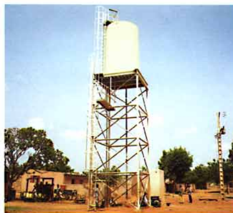
Yirimadio's Simplified Water System: A well with an electric pump feeds a raised water storage tank, which provides water to three standpipes.