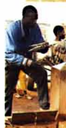
The plumber repairs a standpipe.