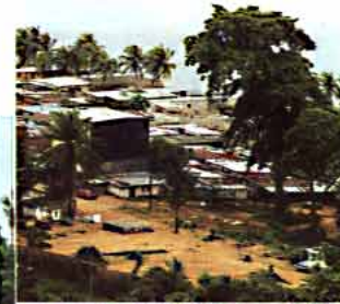
Unplanned settlements account for more than half of Abidjan's area. Underserved neighborhoods and dwellings clustered around a common courtyard are home to 70 percent of the city's households.