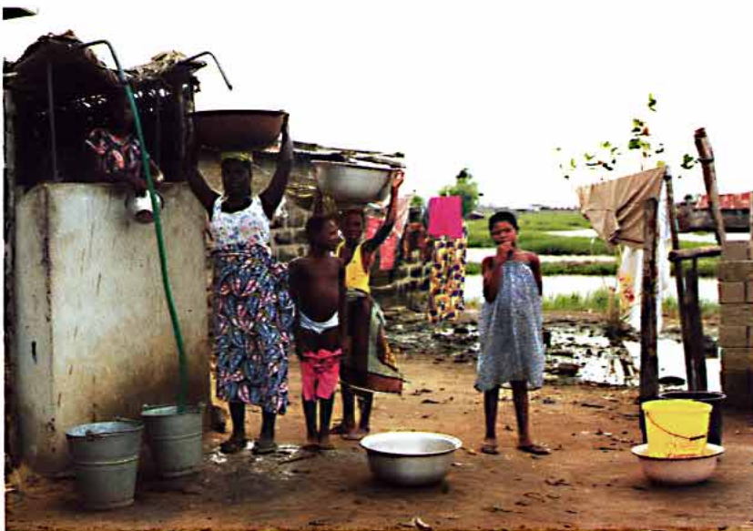
Women (with help from their children) are often in charge of water resale as a secondary income source, since their primary source of income is often located close to home.

Cotonou: population 1,100,000 - 1,000 CFAF = US$ 1.60