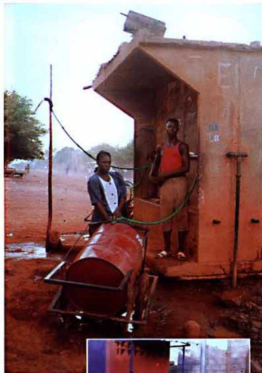
Water resale is provided by young rural migrants, paid 5 to 15 percent of sales volume (CFAF 5,000-7,000/month) by the standpipe manager.