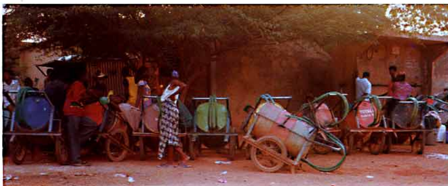
Handcarts clustered around a standpipe.

The standpipe manager supervises standpipe operations on a daily basis, recording the volume of water sold and collecting the money. In April 1999, his profit amounted to CFAF 125,983.