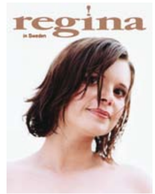
regina in Sweden , magazine published by Moderna Museet Projekt Stockholm (curator: Maria Lind), No. 4, Dec. 2000