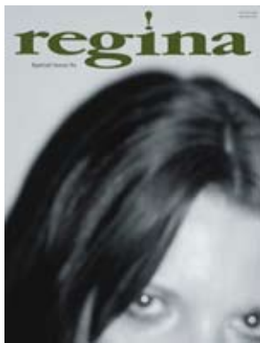
regina - Special Issue ifu , magazine published by Internationale Fraununiversität - ifu, No. 5, Dec. 2000