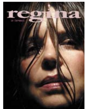
regina in Cornwall , magazine published for ProjectBase (director: Sara Black), No. 8, July 2007