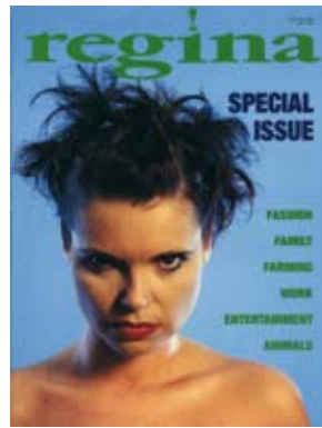
regina - Special Issue , magazine published by artranspennine98, (guest curator: Iwona Blazwick), No. 3, May 1998