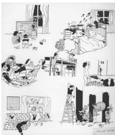
Livre á Colorier in collaboration with the kindergarten Le Corbusier in Firminy, Project Unité, Firminy, May 1993