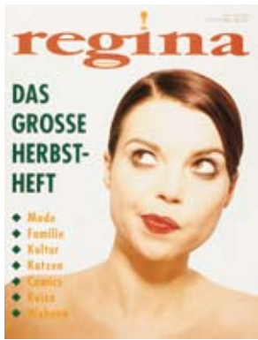
regina - Das Große Herbstheft , magazine published by Künstlerhaus Stuttgart (artistic director: Ute Meta Bauer), No. 1, Oct. 1994