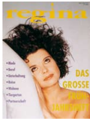
regina - Das Große Frühjahrsheft , magazine published by Kunstverein München (director: Dirk Snauwaert) No. 2, March 1997