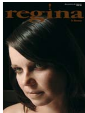
regina in Norway , magazine published by OCA | Office for Contemporary Art Norway (director: Ute Meta Bauer | curator: Christiane Erharder), No. 7, Oct. 2005