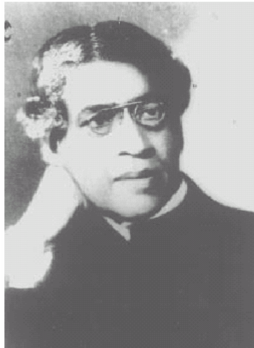
Figure 1: Sir J. C. Bose

The invention of radio, one of the most important inventions of the 20 th century is attributed to Guglielmo Marconi of Italy. Though it is disputed whether Nikola Tesla's patent on radio precedes that of Marconi, it is well-known that the first demonstration of radio transmission over several thousand miles was done by Marconi in the year 1901. There have been other claims of radio transmission which precede that of Marconi, but Marconi's experiment is the only one which was not conducted in a hidden laboratory and was open for scientific scrutiny and commercialization (which he himself did).\