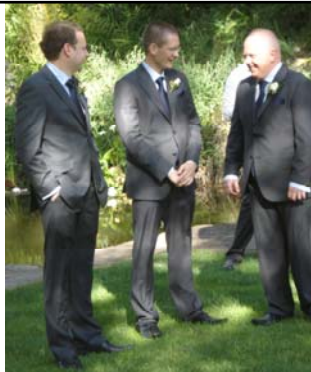
Snickers, Borax and Tooley pretending to be grown up