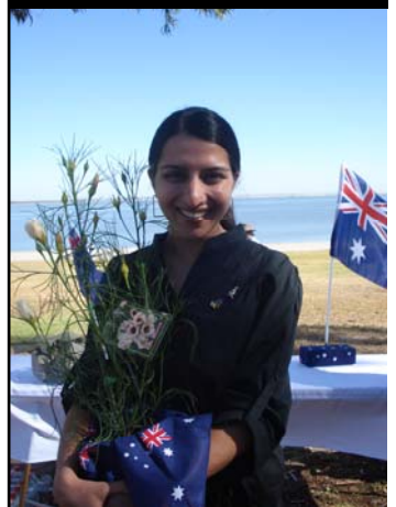
Oi Oi Oi

the credit union Rediteller ATM network, she is looking forward to seeing bold and bright new rediATM machines popping up all over this State and the next!