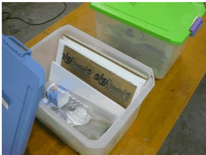
Figure 1 Example kit that will be provided to sophomore design students

The devices will be made from materials provided in a kit (Figure 1) given to each team of students (assume 4 students per team). Materials in the kit will have assigned costs, so the students can compute the cost of their design (see also note at start of the proposed kit contents section below). The kit includes readily available, relatively inexpensive materials that can be incorporated into a design in a number of ways and can be easily fabricated and assembled, such as foamcore, plastic water bottles, and aluminum sheet.