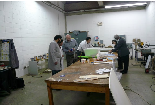
Figure 2 Preparing the sophomore design class laboratory space with KFUPM and MIT faculty and KFUPM students