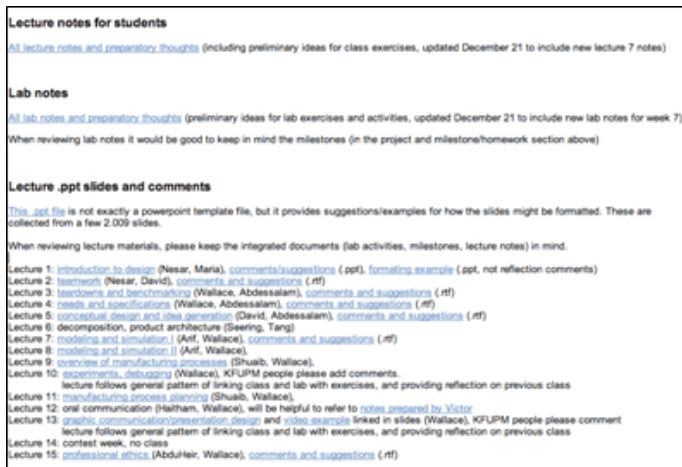
Figure 4 Wiki page showing collaborative development of lecture slides and notes

The KFUPM-MIT design curriculum Wiki was heavily used by all team members, and grew rapidly with the continual uploading of new material. Recently, the Wiki has been migrated to a different MIT-local host in order to accommodate its size. For now, the Wiki works well, although other content management systems such as Share Point may be worth considering in the future.