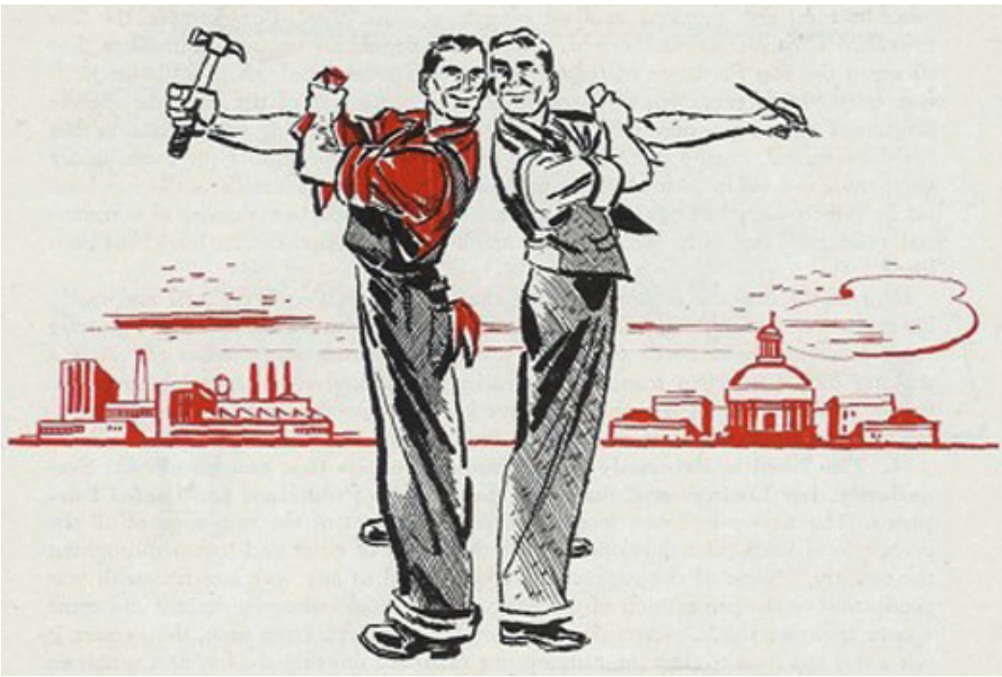
"Construction Potentials: Postwar Prospects and Problems, a Basis for Action," Architectural Record, 1943; prepared by the F.W. Dodge Corporation Committee on Postwar Construction Markets.

It was the Jacobsian revolution and its elimination of a robust physical-planning focus that led to the diminution of planning's disciplinary identity, professional agency and speculative courage. Thus I believe that a renewed emphasis on physical planning — the grounded, tangible, place-bound matter of orchestrating human activity on the land — is essential to refocusing, recalibrating and renewing the profession. By this I do not mean regression back to the state of affairs circa 1935. Planning prior to the grassroots revolution was shallow and undisciplined in many respects. Most of what was embraced post-Jacobs must remain — our expertise on public policy and economics, on law and governance and international development, on planning process and community involvement, on hazard mitigation and environmental impact, on ending poverty and encouraging justice and equality. But all these should be subordinated to core competencies related to placemaking, infrastructure and the physical environment, built and natural. I am not suggesting that we simply toss in a few studio courses and call it a day. Planners should certainly be versed in key theories of landscape and urban design. But more than design skills are needed if planning is to become — as I feel it must — the charter discipline and conscience of the placemaking professions in coming decades.