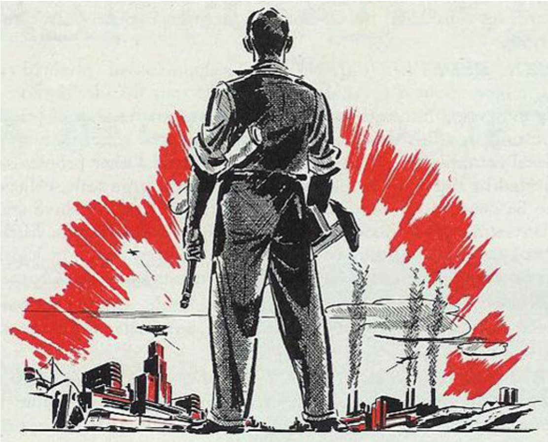
"Construction Potentials: Postwar Prospects and Problems, a Basis for Action," Architectural Record, 1943; prepared by the F.W. Dodge Corporation Committee on Postwar Construction Markets.

And the end of all our exploring Will be to arrive where we started And know the place for the first time. — T. S. Eliot, "Little Gidding"