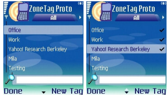
Figure 2. Users can choose to add tags to the photo before it is uploaded. A list of suggested tags is shown (left), and the user can select them (right) or type in new tags.

with the image. The controls include the option to set the image privacy settings: following the Flickr model a photo can be completely private; viewable only to Flickr users marked as 'friends' or 'family' by the photo owner; or public. The user has the option to specify a title for the photo, which appears on the Flickr photo page. Finally, the user can choose whether to expose the photo's location data. If she chooses to include location data, the zip code and city names are added as tags to the photo's page on Flickr. Most importantly, the user has an option to select or type in tags (textual labels) to appear on the Flickr photo page. Tags on Flickr are used for personal organization and public sharing; both generate incentives for some people to tag.