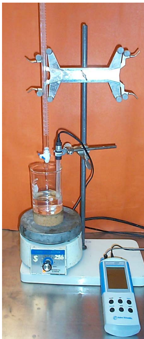
Fig. 3. Titration apparatus: 400-500-mL beaker, 1" stir bar, 25-mL buret, magnetic stirrer, cork, electrode connected to Accumet AP61 pH meter.