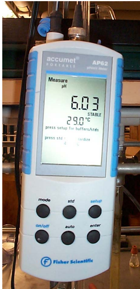
Fig. 2. The portable AP62 pH meter