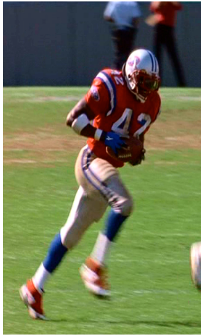
The mysterious Ray Smith, after he intercepted for a touchdown in Washington's 14-10 loss to Detroit.

Washington Sentinels owner Edward O'Neill is refusing to comment on the identity of Ray Smith, one of the many substitute players brought in following the recent football strike. According to Clifford Franklin, a substitute running back, Smith kept mostly to himself and never discussed his life outside football. Jamal Jackson and Andre Jackson both insist that Smith is a football coach who likes to embroider, and is not a dangerous convicted felon. According to some rumors, Smith is really Deion Sanders, who attempted to reenter professional football during the strike, but wanted to protect his reputation among other striking players.