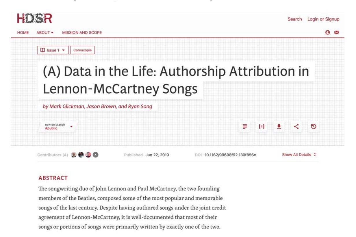
Screenshot of a journal published on the new Harvard Data Science Review website.

One of our flagship publications, launched in June, is the Harvard Data Science Review . HDSR is a new open access journal that includes complex data visualizations.