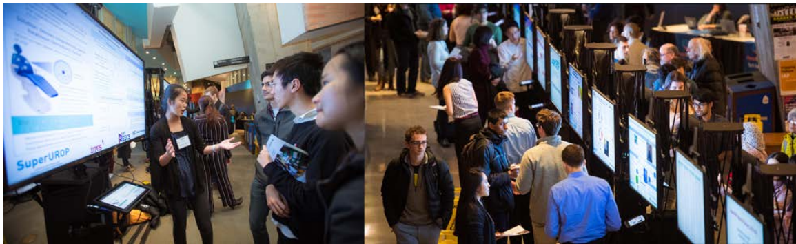
Visitors and presenters at the SuperUROP fall 2019 Poster Showcase.

The Poster Showcase held on December 5, 2019 was strongly supported not only by students and staff but also by outside delegates representing industrial sponsors and donors, with a total of 147 people in attendance. Much of the laboratory research work had been completed by mid-March 2020 when the COVID-19 statewide lockdown was imposed; thus, the program was able to successfully pivot to a remote implementation, although the in-person spring showcase had to be cancelled. Overall, approximately 90 students completed the program in 2019–2020.