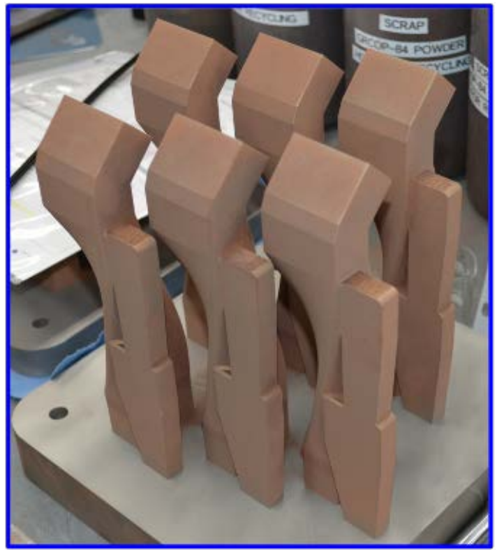
3D printed waveguide structures for the Lower Hybrid system.