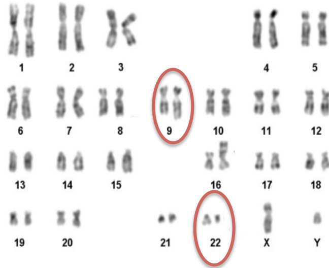
All of the chromosomes in a "CML" cancer cell