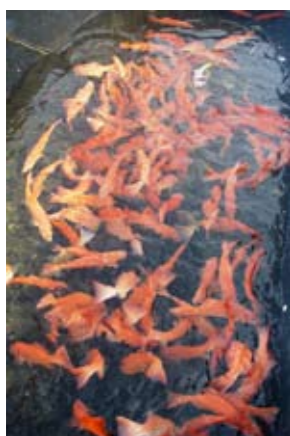
Hook and line fisherman with his day's catch of a dozen live coral trout ( Plectropomus leopardus ) to sell to a live reef fish grower.