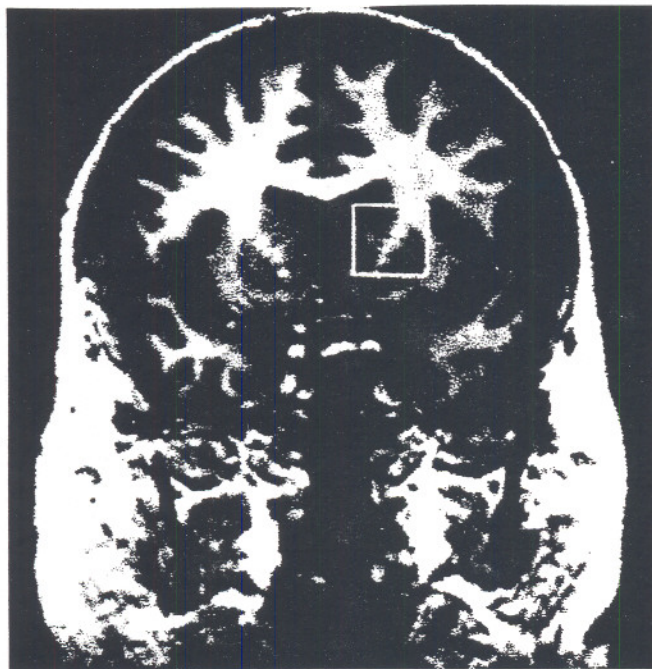
Figure 2.—Proton magnetic resonance spectra were obtained from a voxel centered on the basal ganglia, as outlined in white (left). Spectra are shown for a representative subject before (top right) and 3 hours after (bottom right) ingestion of choline (50 mg/kg). Boxes indicate the relative areas under the resonance peaks for choline (red), creatine (green), and N -acetylaspartate (blue).

uptake of choline, as measured by the change in the brain choline-creatine ratio following ingestion of choline ( R^2=0.007 by linear regression; P=.80 ).