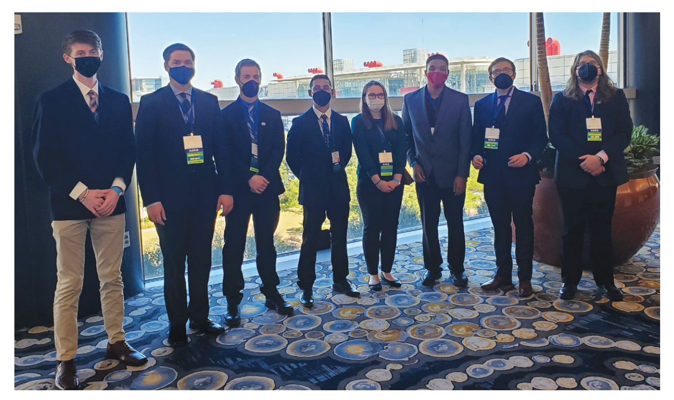
Iowa State University student chapter members attended the 21st Annual AMS Student Conference in Houston, Texas, where they were able to network and build connections with other students and the professionals in attendance. Several of the students had the opportunity to present on research they had performed over the past year.