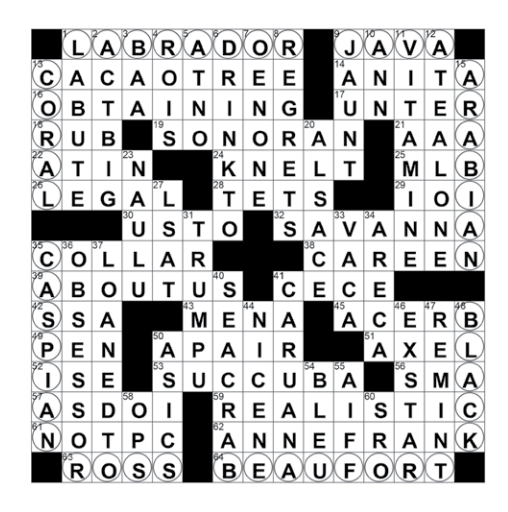
Answers to the puzzle on page 295.