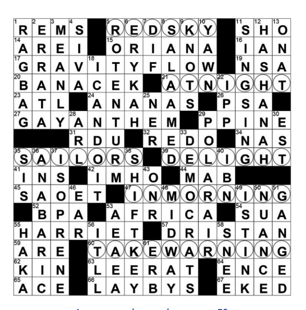
Answers to the puzzle on page 52.

This fraying of the nation's social fabric may represent the greatest cost of all. ullet