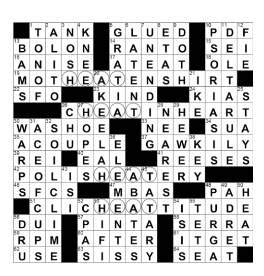
Answers to the puzzle on page 449.