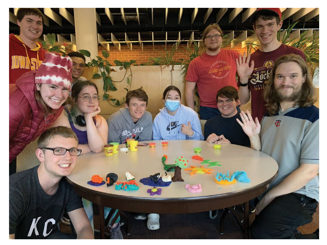
Iowa State University chapter members demonstrated their creative abilities during a Play-Doh crafting contest, with categories including nature and weather as well as other nonmeteorological challenges.