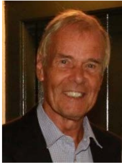
In Cape Town, Feb. 2018

for the analysis of engineering designs and, in general, for the prediction of nature. The author describes how he tried to enrich life through his activities, and found much happiness and success.