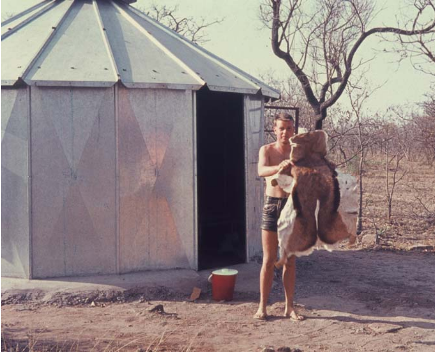
Cleaning the rondavel on the site North of Pretoria