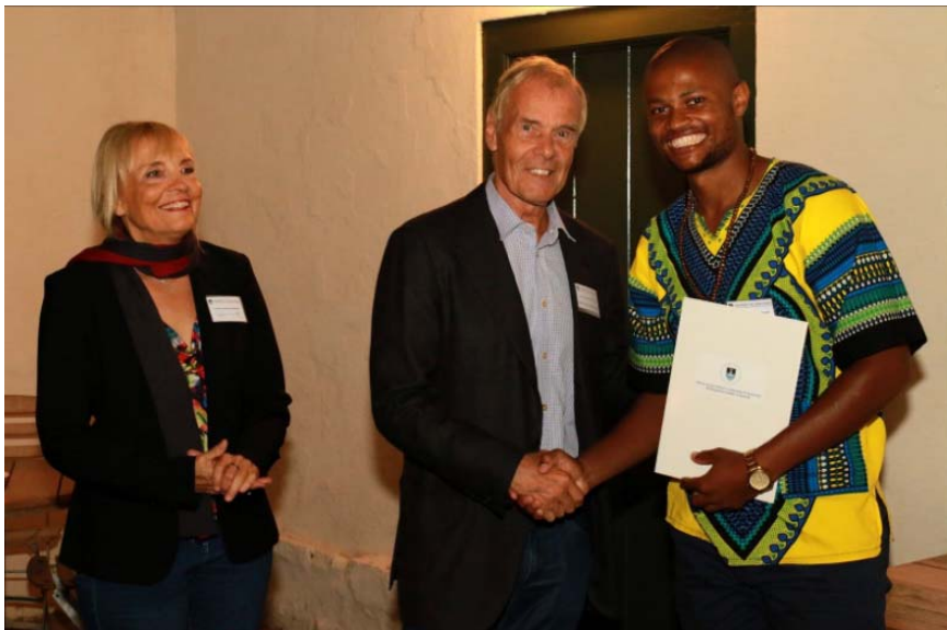
At the Scholars Meeting in February 2018, congratulating a student