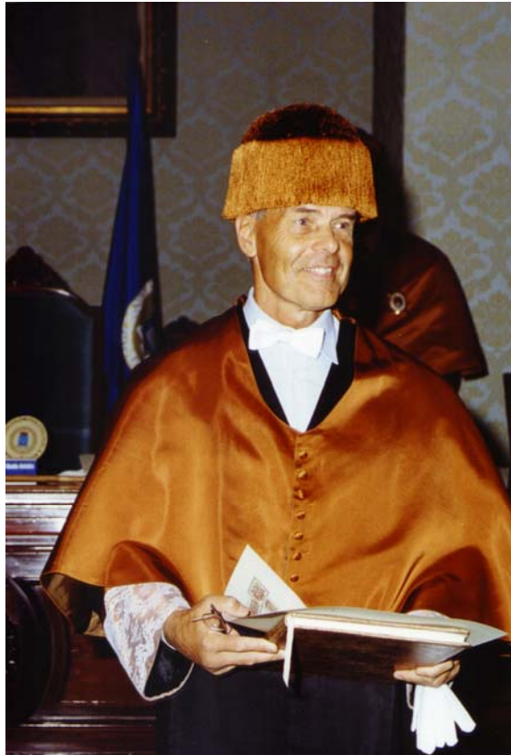
Receiving the hon. doctorate at the University of Madrid in 2005

The hon. doctorate from the University of Bucharest, Romania, was another great reward. I was surprised to learn how much the colleagues in Bucharest had used my books and computer programs, for decades, in their works, in academia and industry — and all that despite Romania was in the East behind the ‘iron