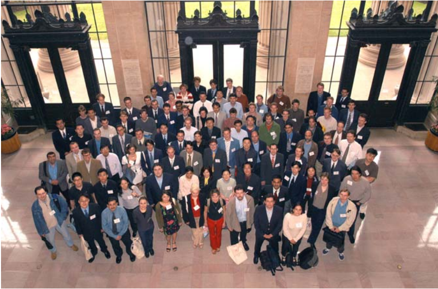
Some of the fully funded young researchers attending the 2nd M.I.T Conference, June 2003

These three M.I.T. Conferences were largely financed by contributions from industry; each time about 20 companies generously sponsored — but only after quite some struggle and convincing from my side. I financially also contributed very substantially to all three conferences from my personal savings, which I did because the aim was to help some young researchers. The Conferences were clearly a great success.