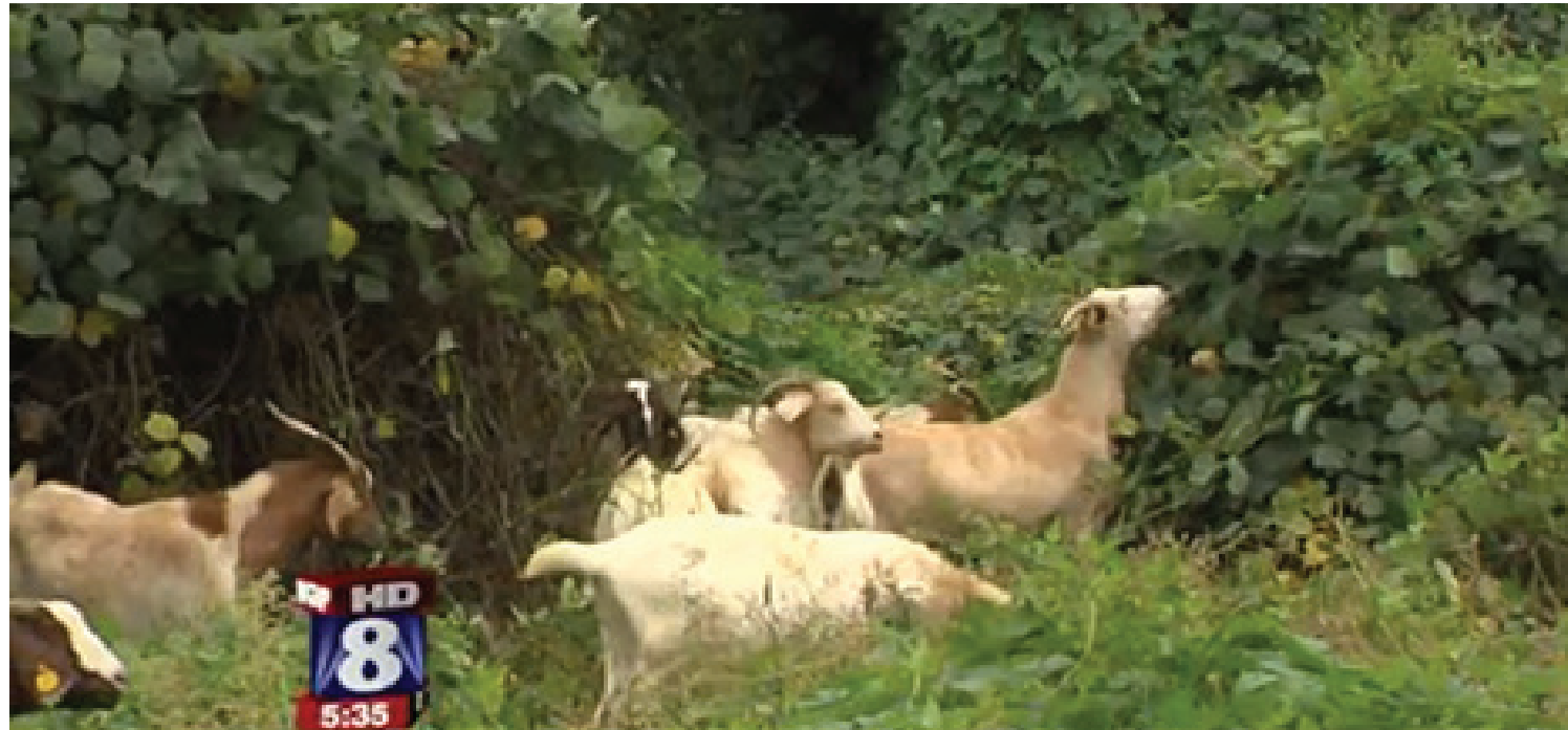
GOATS CLEANING UP HIGH POINT