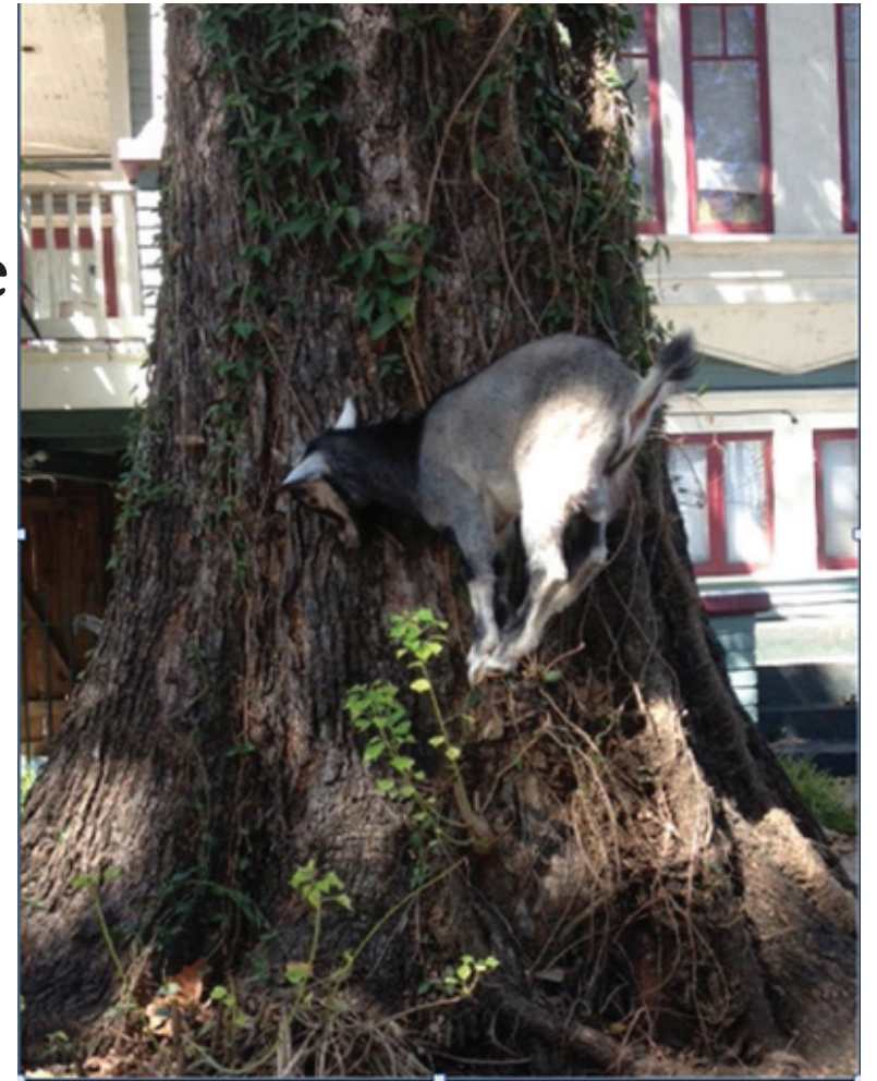
Source: Dave Behmer, Co-Founder, Goats of Progress, Personal Communication

The ability of goats to climb means that they have great accessibility to vegetation even in roadless areas.