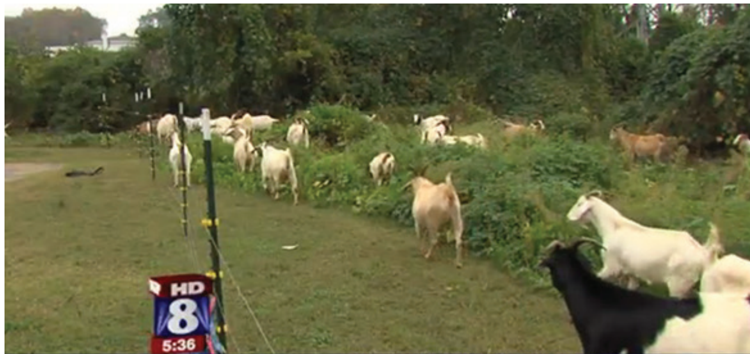
GOATS CLEANING UP HIGH POINT