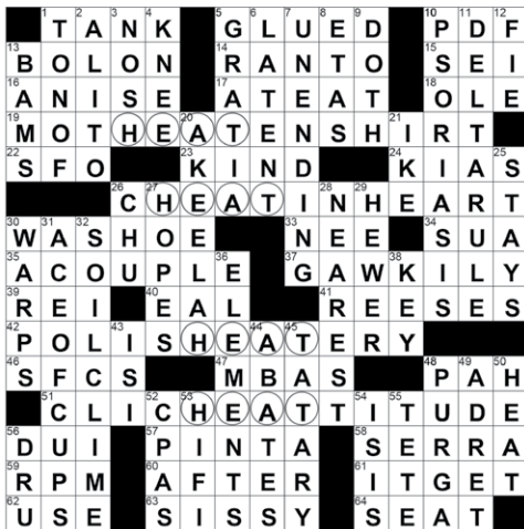
Answers to the puzzle on page 449.