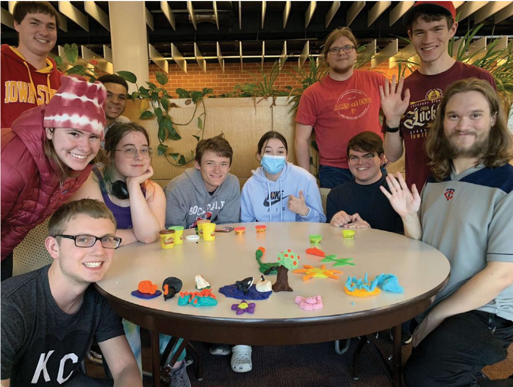
Iowa State University chapter members demonstrated their creative abilities during a Play-Doh crafting contest, with categories including nature and weather as well as other nonmeteorological challenges.