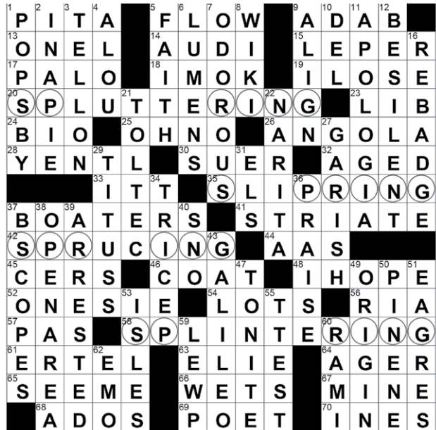
Answers to the puzzle on page 190.