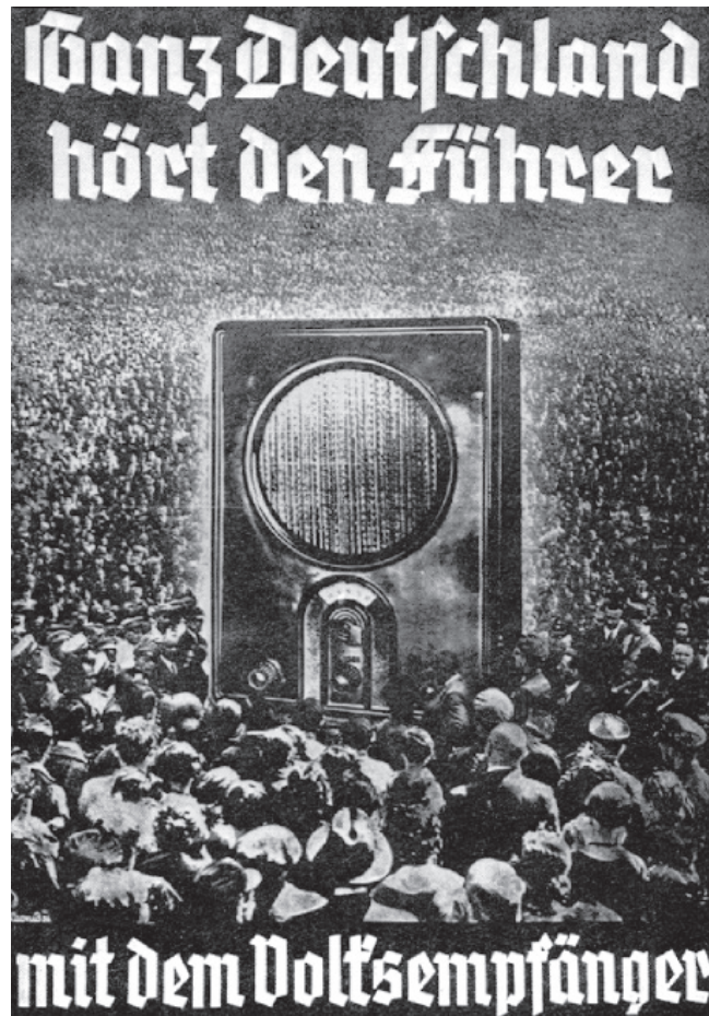
Fig. 5. Promotional poster for National Socialist German radio as a means of linking the nation with its leader, a goal that NS television developers sought to serve. The text translates: "All Germany hears the Führer on the People's Receiver" (ca. 1943-1945).