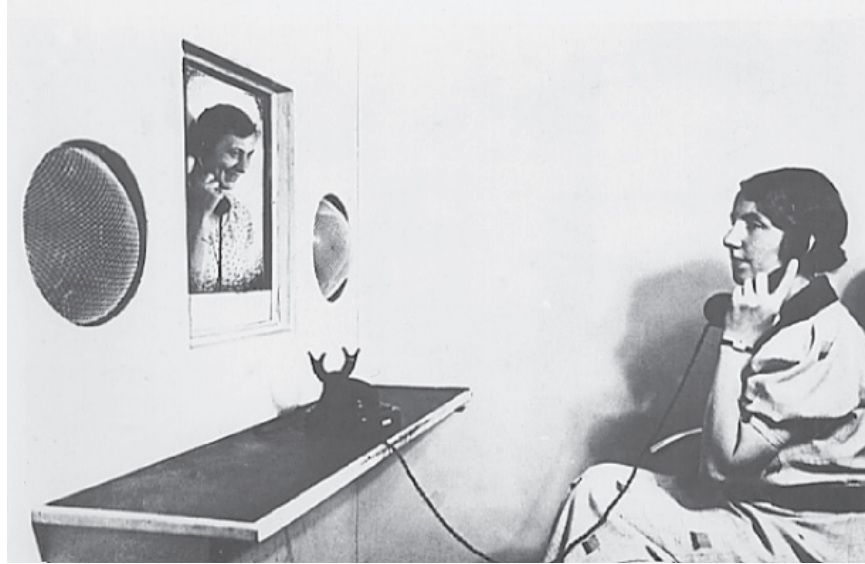
Fig. 4. Promotional photo for Germany's television-telephone service which connected post offices in major cities during much of the National Socialist era (ca. 1939).

rhythms and flow of daily life through a live feed would render the need for persuasive pre-produced programming content (the domain of the Propaganda ministry) redundant. In this case, control of the nation's neural networks, the ability to direct its gaze and forge a live connection between viewer and world viewed, provided the double advantage of superceding the impact of whatever propaganda program texts might be cast before the viewing public's eyes and perhaps even more importantly, served the project of electronically forging a Volkskoerper —a nation, a people, bound together by the synchronicity of experience. The responsible postal authorities were acutely aware of the added value of bridging the gap between subject and object, and the live televisual link promised to conjoin both in a manner that far superceded the capacities of storage-based media.