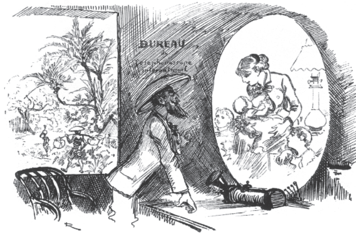
LA SUPPRESSION DE L'ABSENCE.

Fig. 2. Imaginary media: the téléphonoscope in a scenario that supports patriarchal presence in geopolitical and domestic settings. (From Albert Robida, Le vingtième siècle , Paris, Éditions Georges Décaux, 1883)