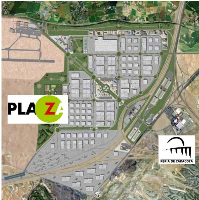
Virtual image of the PLAZA logistics park and the Zaragoza Exhibition Centre.

Adjacent to the conference site is a huge, state-of-the-art logistics park. To spur in the economic growth of Aragón, the government and industry have invested millions of Euros to create PLAZA (Plataforma Logística de Zaragoza) , an 11-million square-meter development with infrastructure for distribution centers, intermodal transportation, customs clearance, and special areas for handling hazardous materials, bulk shipments, automobiles, and agro-foodstuff. Areas designated for commercial, educational, and sports & leisure facilities blend naturally with the industrial areas and the green space. The logistics park is located in the nexus of transport and commerce connections, with its boundaries defined by a major freeway exchange, the high-speed railway connecting to Madrid and Barcelona, and the 24/7 airport, which can accommodate the world's largest cargo planes. Formal tours of the logistics park, currently in Phase I of development, will be available prior to the conference or by special arrangement.